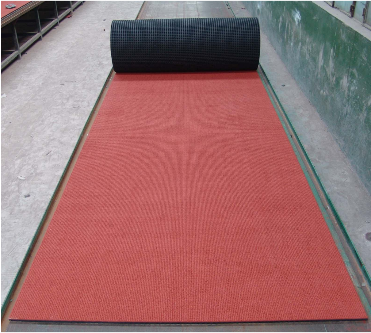
Picture of Athletic Track laid on the base floor surface